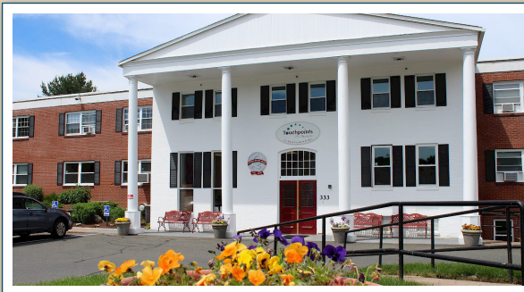
Touchpoints at Manchester 333 Bidwell Street • Manchester, CT 06040