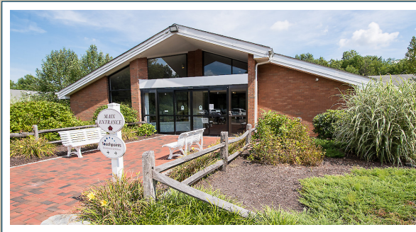
Touchpoints at Bloomfield 140 Park Avenue • Bloomfield, CT 06002