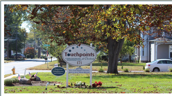
Touchpoints at Chestnut 171 Main Street • East Windsor, CT 06088